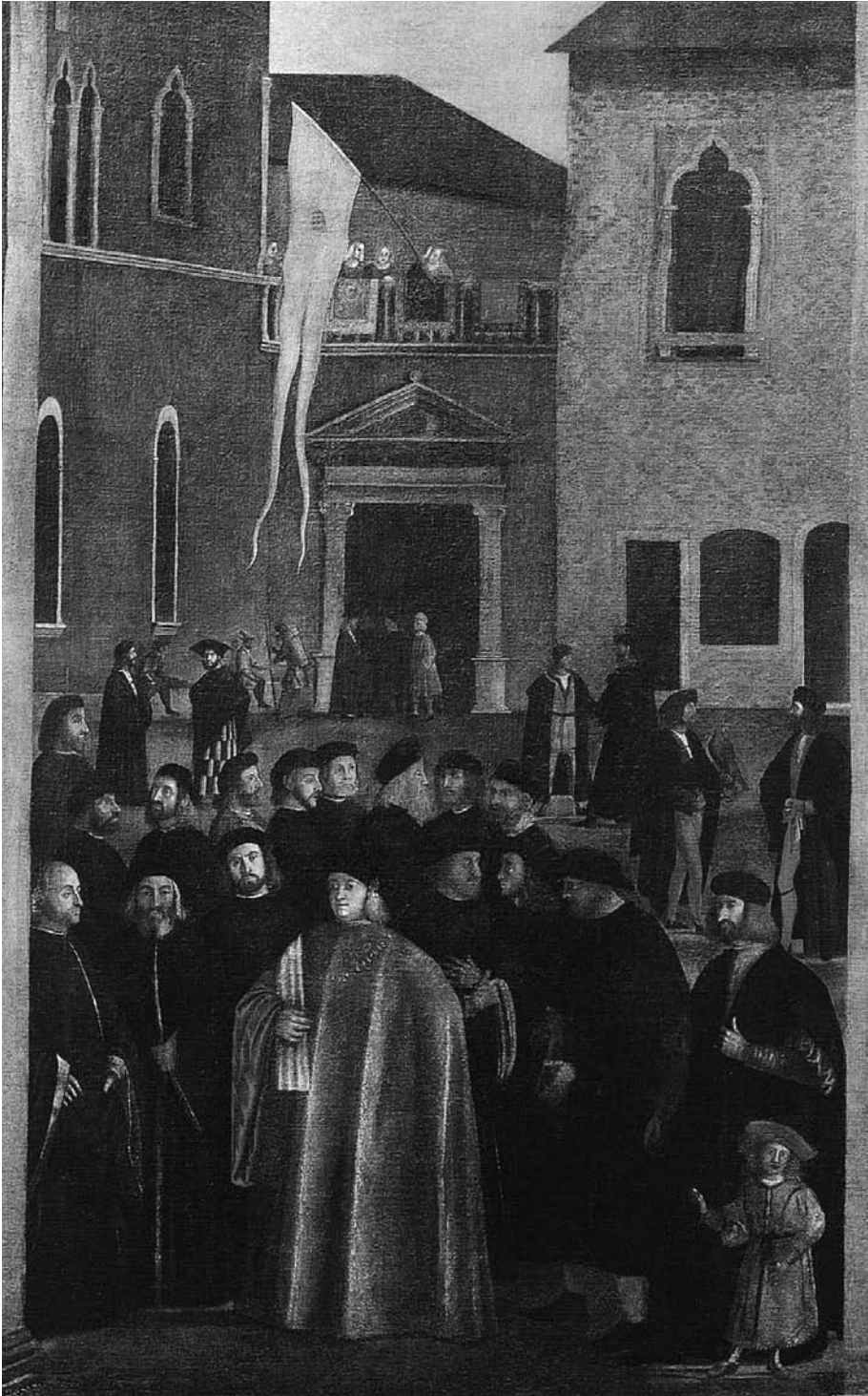
Figure 1: Vittore Carpaccio, Entry of the Venetian podestà Sebastiano Contarini into Capodistria (Koper), 1517.